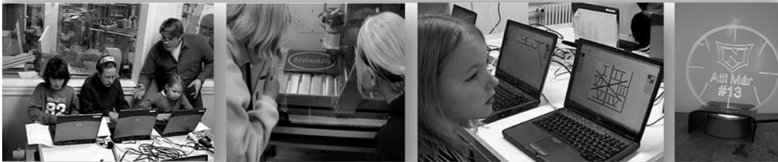
Figure 3. Students work supported by computer aided design and manufacturing

It was soon evident that not all teachers were satisfied with the 1999 curriculum in Design