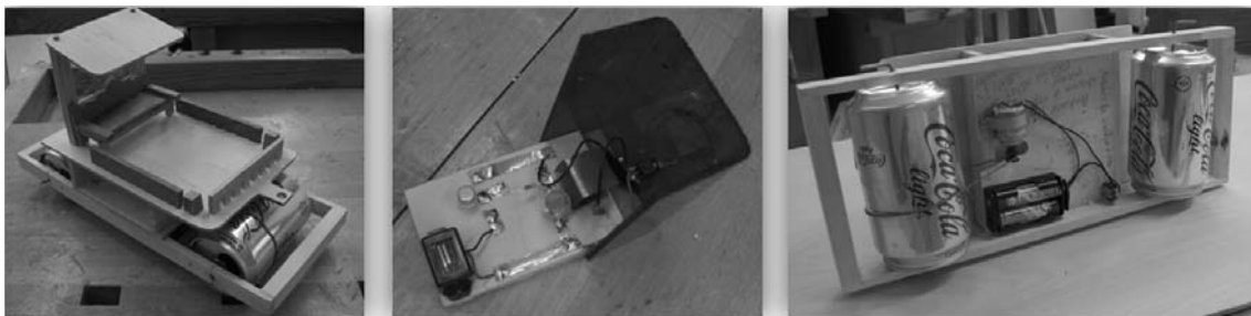
Figure 2. Toys made by students based on simple electronic solutions (© Thorsteinsson 2009 and Gunnarsdottir 2009)

The Icelandic Craft subject was re-established as a new technological subject in 1999, under the name Design and Craft (The Icelandic Ministry of Education, 1999). The new subject was based on a rationale for technological literacy, innovation and design. It became compulsory for grades 1 – 8, but optional for grades 9 – 10. The main aim was to develop technological literacy in students and ideation skills (Thorsteinsson 2002 and Thorsteinsson & Denton 2003). The infrastructure (see figure 8) of Design and Craft was influenced by the national curriculum in New Zealand, Canada and England and a new Icelandic model for Innovation Education. This model arose from the craft subject and was focused on idea generation. After a few years' curriculum development craft became an independent cross-curricular subject named Innovation