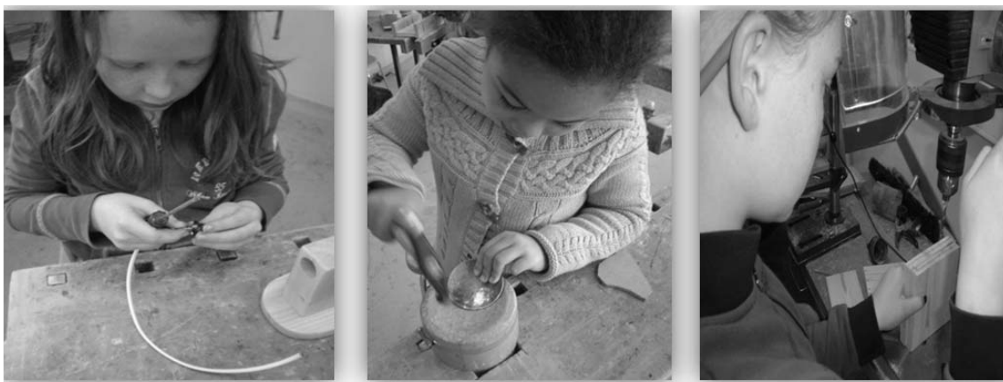
Figure 1. Young Icelandic students at work in the craft room

The above quote includes a purposeful application of knowledge and understanding to generate processes and build products that meet human needs. The human needs in particular communities decide the technology that is developed and how it is used (Page, Thorsteinsson, Lehtonen & Niculescu 2008).